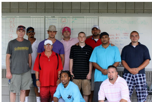
Prior Boulware clients volunteering at the 2011 Golf Scramble.