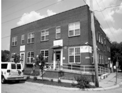
Hall Street Facility

After the February consolidation of the Hall Street and Wing Avenue campuses, the Board of Directors voted to lease the vacated Hall Street building. The Boards decision to consolidate was made in effort to maximize the overall efficiency and operations of the Mission.