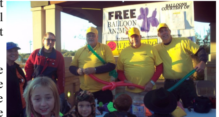
The Twisters twisting at the Trail of Treats at Smother's Park.