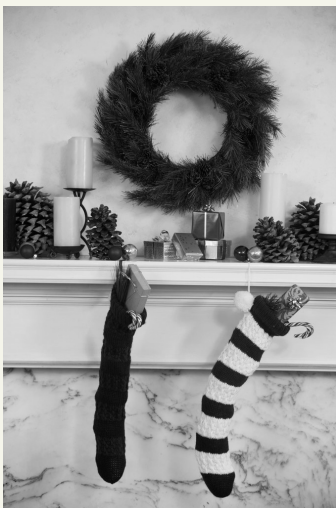
The Mission will be holding an Open House on Wednes-

day, December 14th from 2:00 to 6:00 p.m.